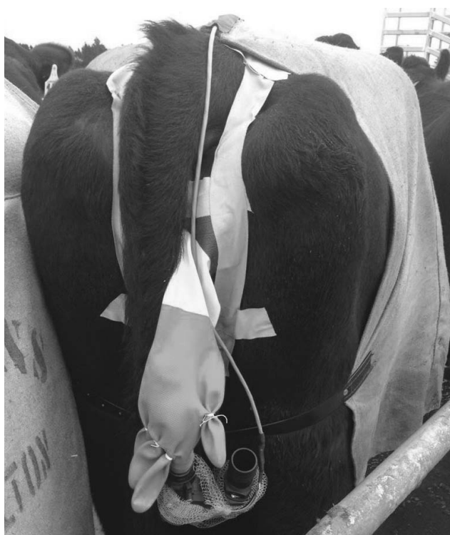
Figure 1 Urine meter on a dairy cow. The modified glove attachment was glued around the vulva and urine was channeled through the flow meter. Strapping tape was used to support the weight of the meter across the flank and pins of the cow and also helped prevent faecal contamination. Information from the flow meter is stored in a data logger which was attached to the cover.

The meter itself was attached to the vulva of the cow by gluing (Henkel's Loctite Power Flex Gel) the modified glove attachment to the exterior skin around the vulva, and using strapping tape to support the weight of the meter across the flank and pins of the cow. The strapping tape also helped to prevent faecal contamination into the meter. The meter weighed around 100 g; initial attempts to transfer its weight to the cow cover failed as they restricted the movement of the glove causing it to kink during urination, slowing the flow of urine through the sensor. Therefore the meter was only attached to the cow's skin (Fig. 1). During the development and testing phase three non-lactating dairy cows were used to assess effectiveness of the device and any potential welfare issues. Cow behaviour was initially altered when the cover was fitted to the animals. Some cows ran or bucked shortly after the cover was fitted, though normal activity (grazing) resumed within 30 minutes. Cows were subsequently given 24 hours to adapt to the cover before the urine meter was attached.